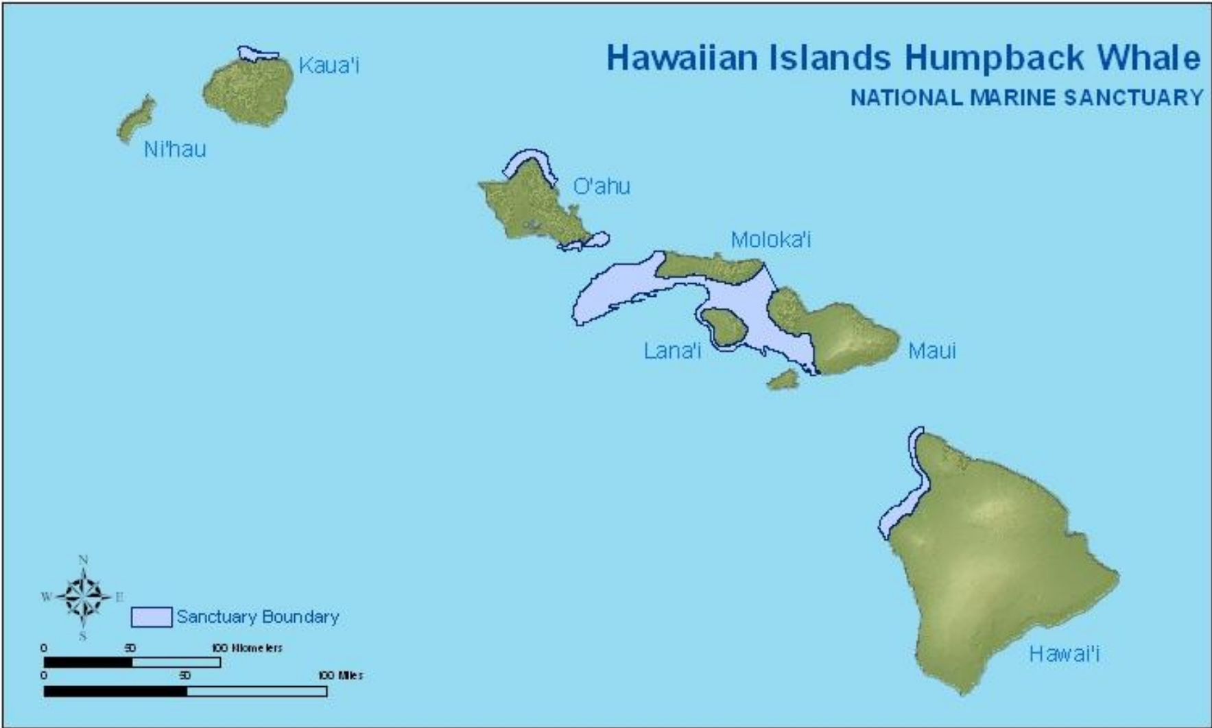
Figure One. Boundaries of HIHWNMS